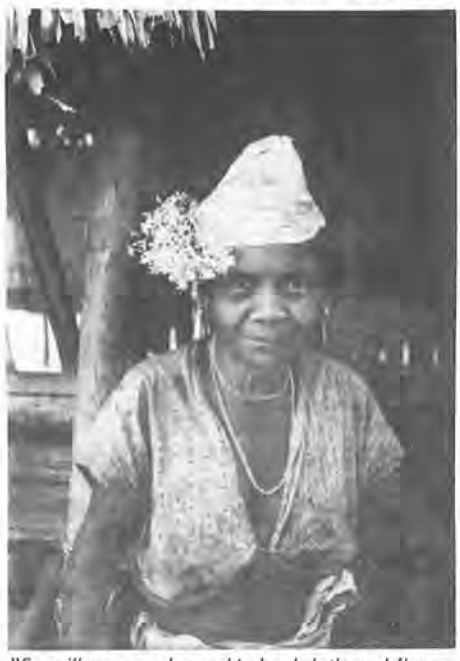
"Senoi" woman dressed in barkcloth-and-flower hat and blouse for song-ceremony, 1962.

Most people do not trust dreams "unless you dream them three times." "We used to have true dreams, but no more." Obvious wish fulfilment in dreams is always -pipuuy: "You dream of sleeping with a pretty girl and