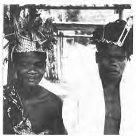
Young Semai and Temiar men with woven headdresses. They are preparing to flirt at songceremony. Leaves and flowers are scented to attract gunig.

I dreamed last night a huge python was in my father's house. I was