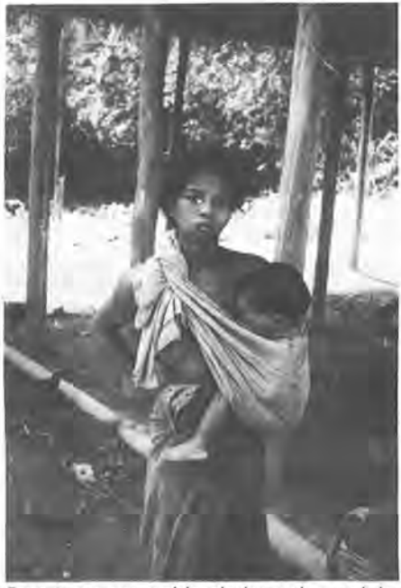
Tamair woman and her baby underneath her longhouse. 1962.